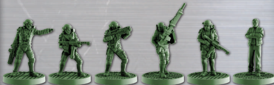
Sgt. Al Apone Cpl. Cynthia Dietrich Pvt. Tim Crowe Pvt. Mark Drake Pvt. Trevor Wierzbowski Carter Burke

These additional dice give you enough for one per player in most missions.