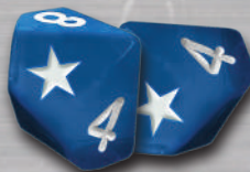
MARINE DICE x4

These ten sided dice (D10) are identical to those found in the Another Glorious Day In The Corps box.