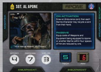
CHARACTER CARDS x6