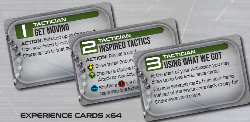
EXPERIENCE CARDS x64